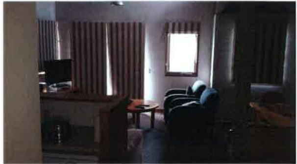
Upstairs dining and lounge