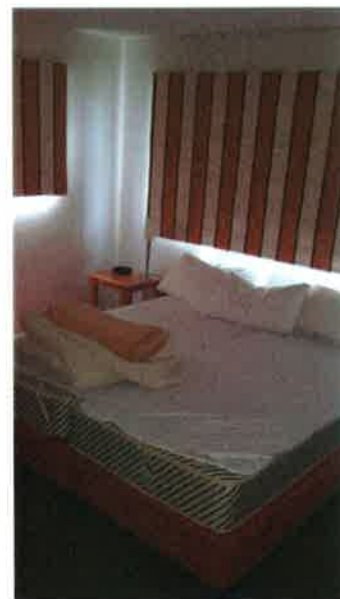
Existing Downstairs bedroom