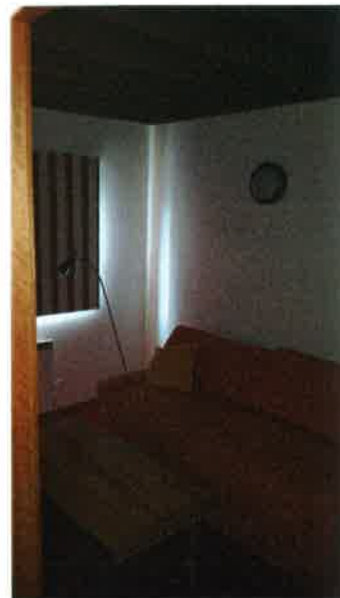
Existing downstairs lounge area to be converted to Den