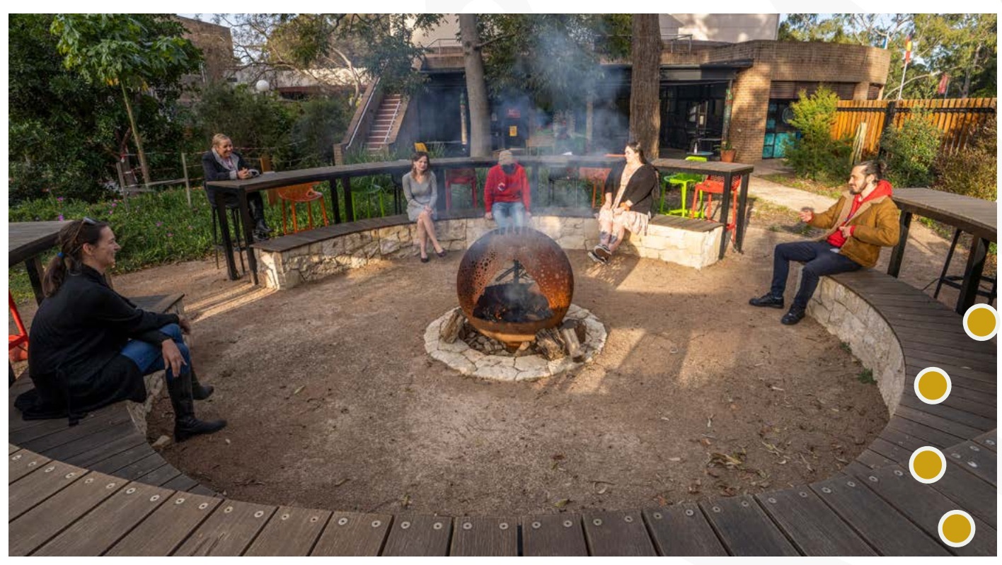
Image: People sitting around UoW Yarning Circle, Illawarra.