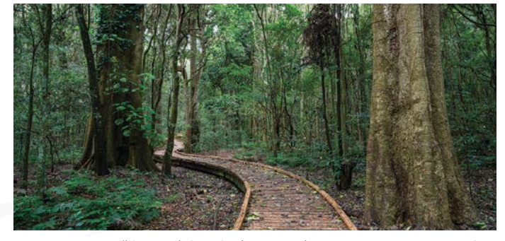
Image: Walking path in Wingham Brush Nature reserve. Taree, NSW.

Many Aboriginal communities dress casually but conservatively. Project teams should dress in a way that reflects this, avoiding anything revealing, and following a comfortable, casual business attire approach which is suited to the environment (e.g. long pants or skirts, and longer-sleeved shirts and tops).