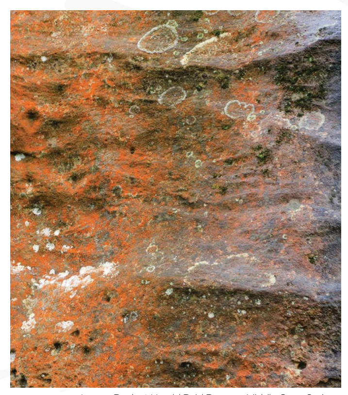
Rock at Harold Reid Reserve, Middle Cove, Sydney.

This round of engagement will help to inform the project team of the level of interest within the community and highlight the topics to discuss during further engagement.