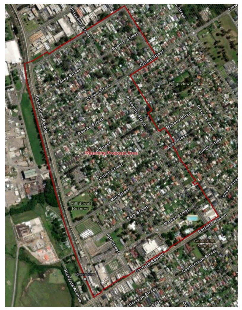
Riverstone Town Centre rezoning area

With direct rail lines to Parramatta, Blacktown and the Sydney CBD, and near Tallawong and Rouse Hill metro stations and the M7 motorway, the Town Centre is ideally located to provide residents and visitors with access to metropolitan Sydney and beyond.