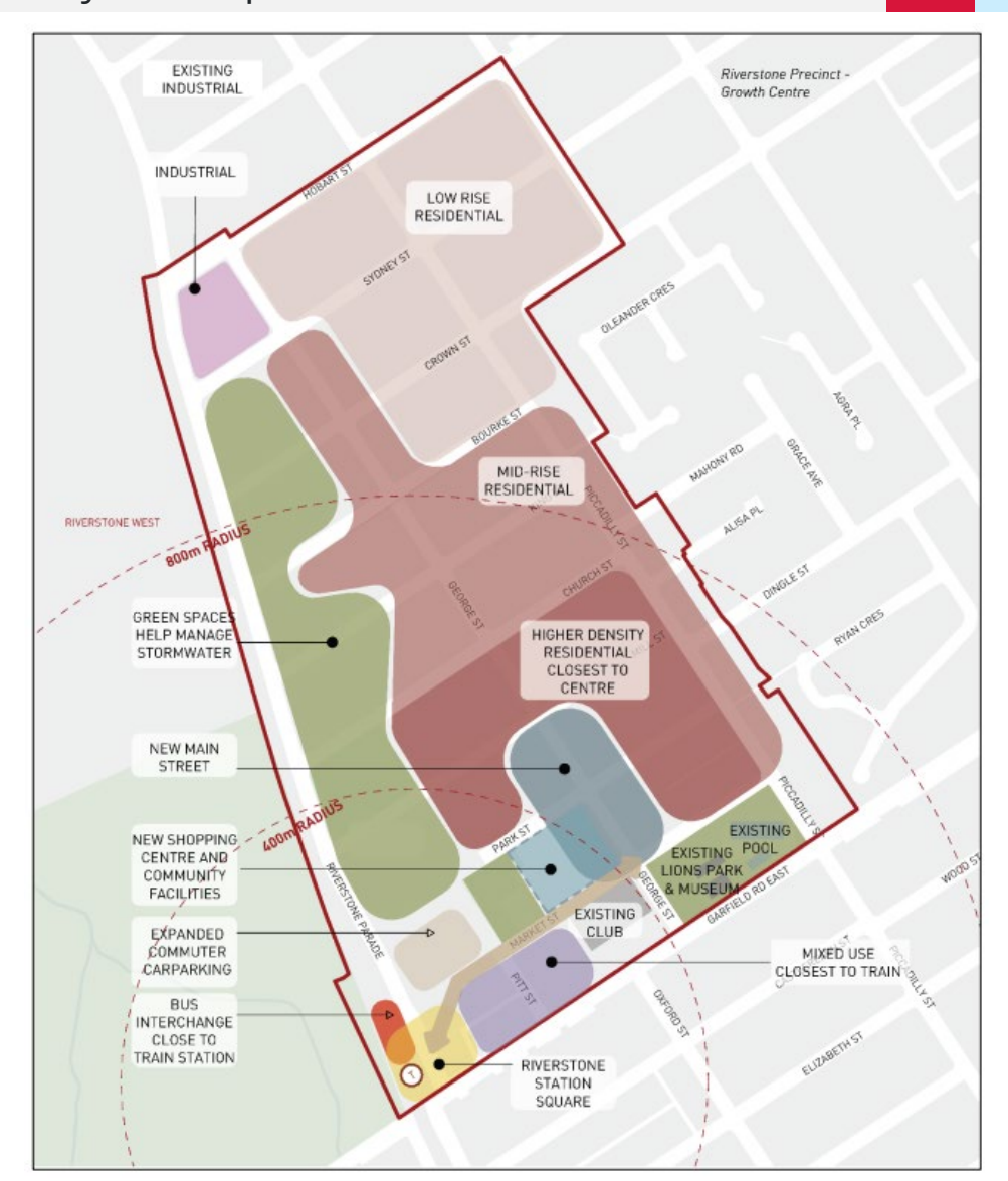
Key features of the Proposal